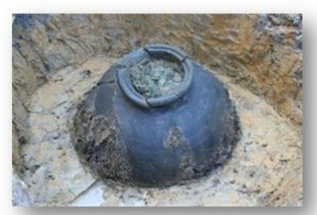
British Hoard Discovered 2007 Containing 52,000 Roman Coins

Of course the guardians of European monetary union have refused to discuss in public the possibility of any member state abandoning the euro. This would merely highlight how the politicians did not know what the hell they were doing from the outset. Without TERM LIMITS , politicians are incapable of making economic judgments. The truth now dawns with each new day that Greece and other weak euro zone economies gave up their economic sovereignty to join the euro. That price for remaining bound to the single currency is being exposed as economic hardship and sacrifice that threaten civil war. The fools that buy sovereign debt get what they deserve — UNSECURED instruments that are worthless in time of