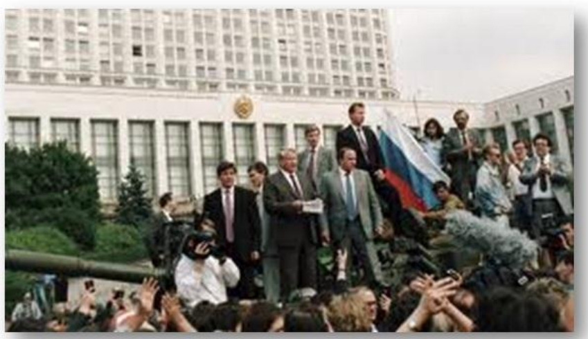
August 19th, 1991 - Borris Yeltsin Stands on a Tank to Stop the Coup